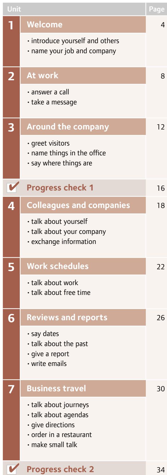
Table of contents A1